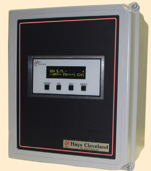
Model A-10050-A0 O 2 Analyzer Electronics

unless auto-calibration is a site requirement. The semi-automatic calibration method includes a flow panel (Model C06) for continuous control of the reference air and for calibration air. This probe requires only a single calibration gas (nominal 4.5% O 2 in N 2 ) supplied in a cylinder with a regulator and gauges (Model FZ1-FZ2). An annual calibration check is recommended.