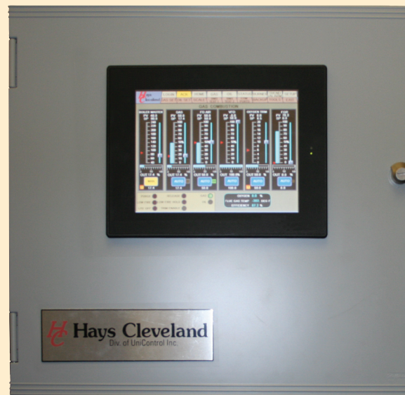
Hays Cleveland's UPAC™ Control System is now available in a pre-engineered package, UPAC LT™.

With the success of HC's plant wide control system, UPAC™, we identified the need for a system specific to boiler control applications incorporating the same accuracy, fuel savings and safety strategies as UPAC™. UPAC LT™ is designed to maximize the return on investment for linkageless parallel positioning with O 2 trim. UPAC LT™ incorporates the unique HC fuel/air safety strategies, including fuel/air ratio cross-limiting and deviation-limiting with a dedicated system fault. Alarm outputs are available for annunciators or panel lights for actuator (servomotor) fail, high/low steam pressure and high/low flue gas temperature, and a low O 2 alarm. Two packaging options are available (surface mount cabinet and open mount).