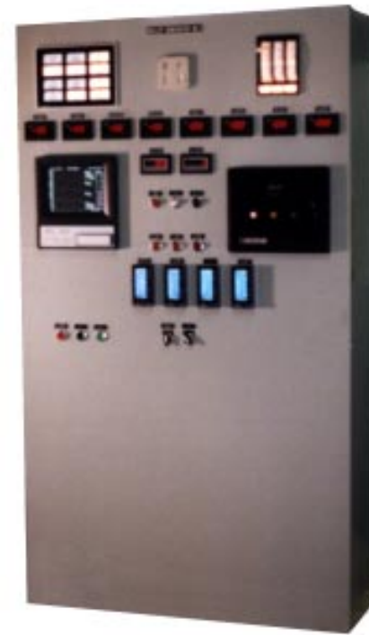
Above: TYPICAL PROCESS INSTRUMENTATION PANEL