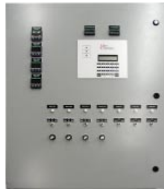
Above: CUSTOM 4-BOILER SEQUENCING SYSTEM