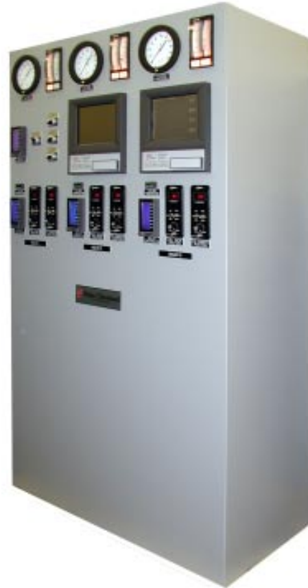
Right: TYPICAL COMBUSTION CONTROL MASTER PANEL FOR 3 BOILERS